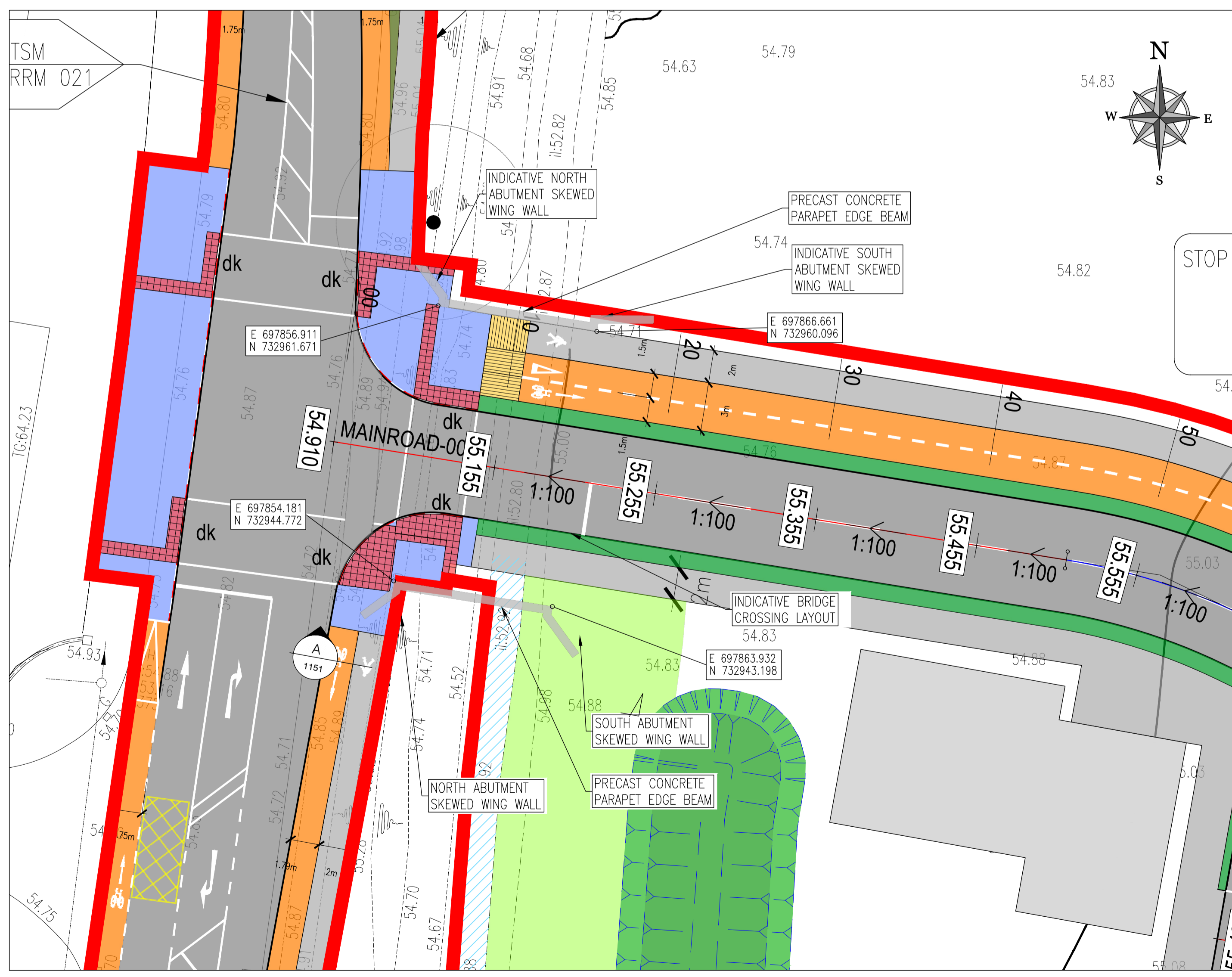
TYPICAL PLAN ARRANGEMENT FOR BRIDGE CROSSING NO. 1 SCALE 1:50